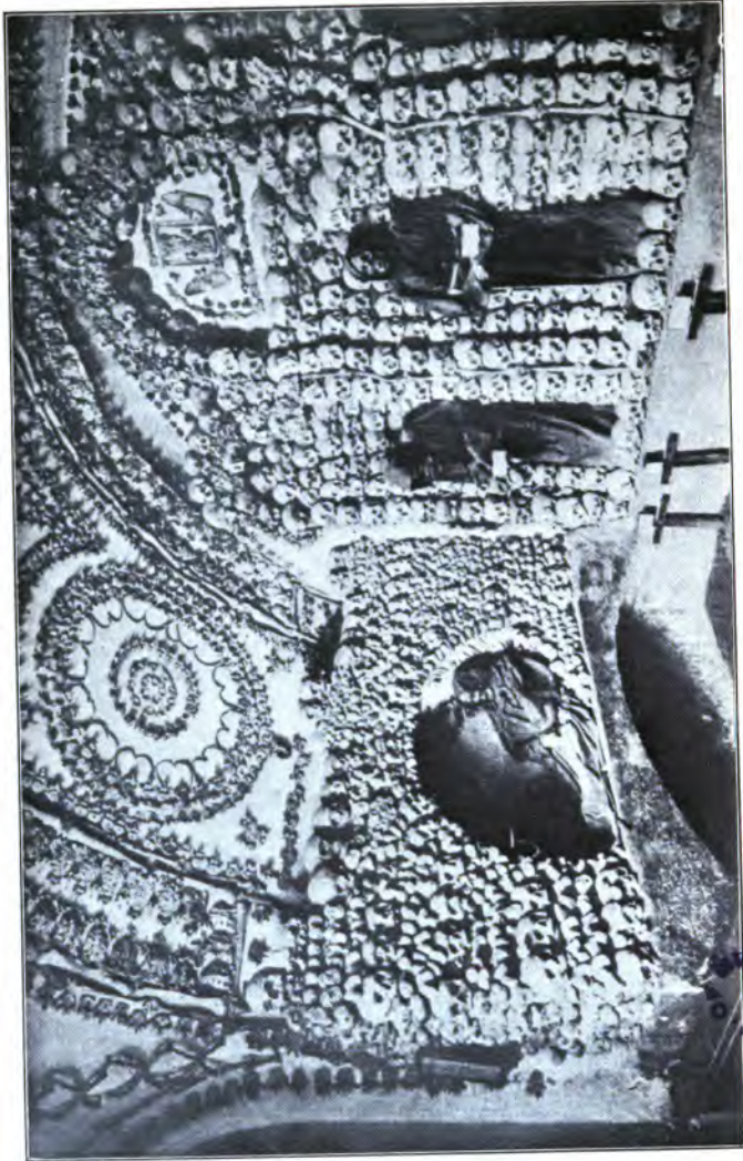
A CORNER IN THE CAPUCHIN CONVENT